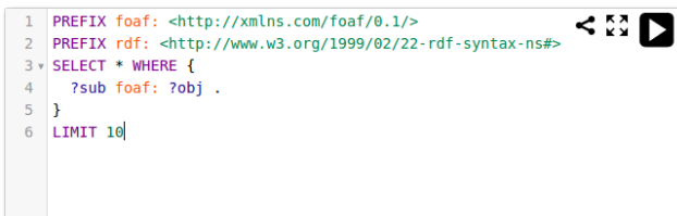
Fig. 2. The YASQE interface

YASQE 21 (See Figure 2) is an extensive JavaScript library, targeted at Semantic Web publishers. YASQE takes a simple HTML text area, and – with one JavaScript command – transforms it into a full featured IDE-like SPARQL query editor.